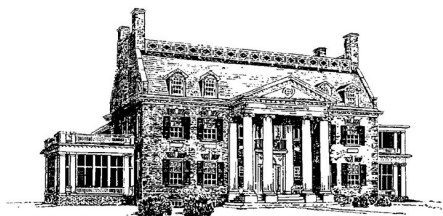
JULIUS W. HEGELER II FOUNDATION

The Danville Public School Foundation received a gift of $250,000, a continuing Title Sponsorship of the Foundation's 365 Club Breakfast, along with a sizeable bequest that will allow the School Foundation to sustain its mission for years to come.