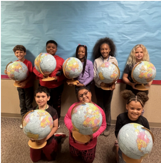
Students from Southwest Elementary with world globes!