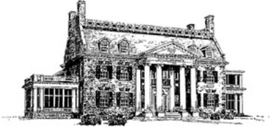
JULIUS W. HEGELER II FOUNDATION

If you are reading this and are not a 365 Club member we would like you to consider becoming a member by pledging at least $1.00 a day in support of the Foundation's mission. Please give us a call at 217-444-1038 or visit dpsf.org for more information.