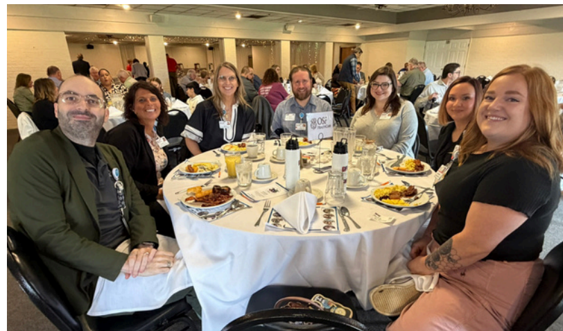
OSF employees enjoying the 365 Club Breakfast.

Over the past year, the foundation has provided more than $170,000 to support its mission of enhancing educational opportunities for students in Danville Public Schools.