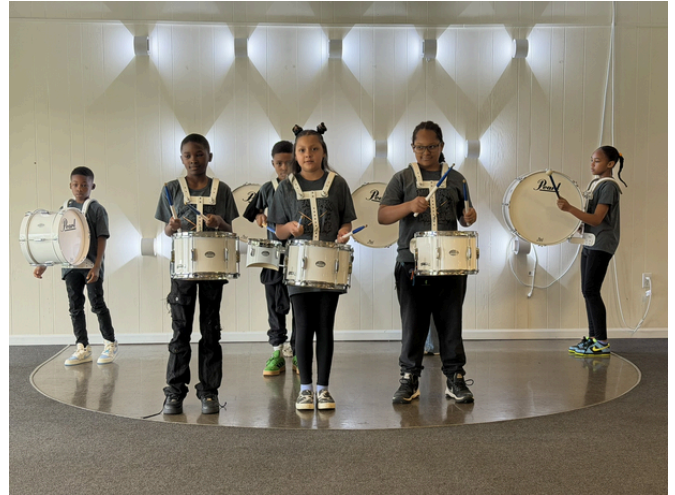
Meade Park Elementary Student Drummers